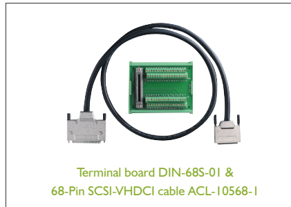
Terminal board DIN-68S-01 & 68-Pin SCSI-VHDCI cable ACL-10568-1

Terminal Board with One 68-pin SCSI-II Connector and DIN-Rail Mounting (cables are not included; for information on mating cables, refer to Section 14, Accessories.)