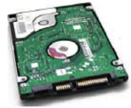
2.5" hard drive