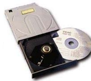
5.25" slim CD-ROM