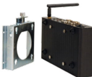
• 75mm VESA mounting hole at the back.