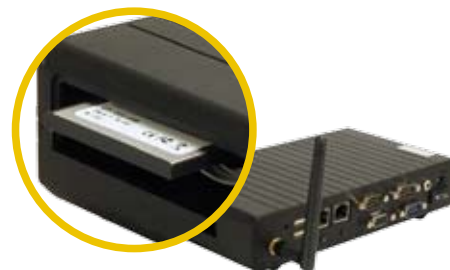
• CompactFlash opening on the side of the box with rubber cover.