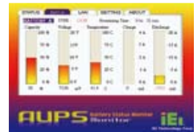
IEI Smart Battery Monitoring Software. Can support remote monitoring from RJ-45.